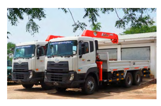
Cargo Truck with 5 ton Crane