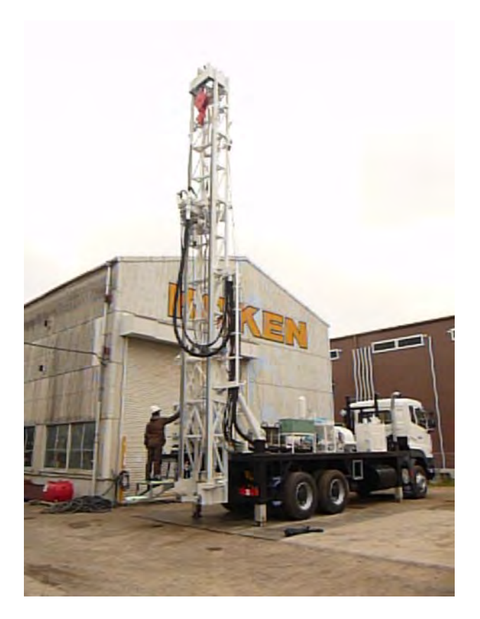
13 JULY 2018 NYAUNG OO, MANDALAY