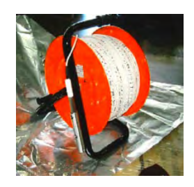
Water Level Indicator